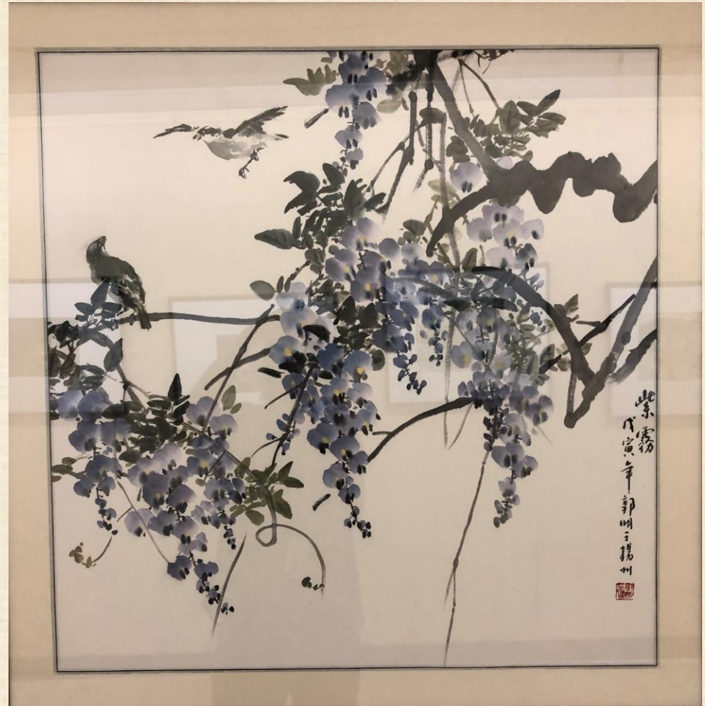
Guo Ming, Purple Fog , 1998