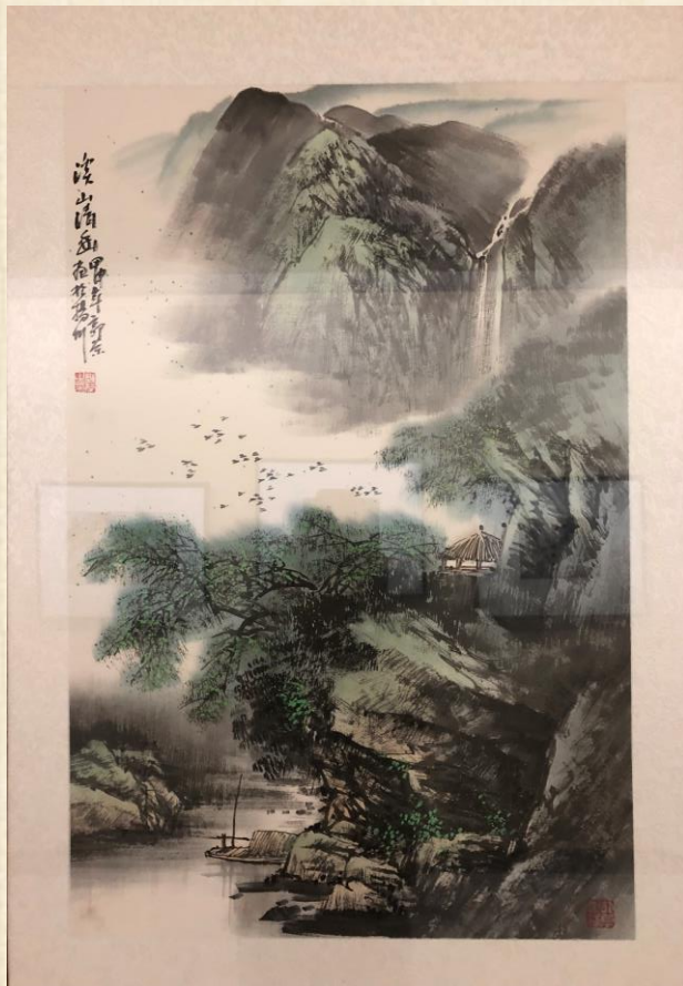
Guo Rong, Streams and Mountains – Clear Hills , 2004