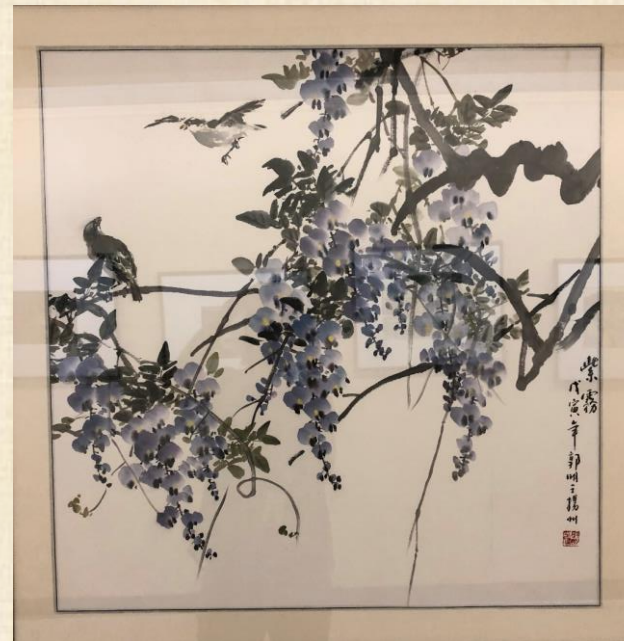
Guo Ming, Purple Fog , 1998