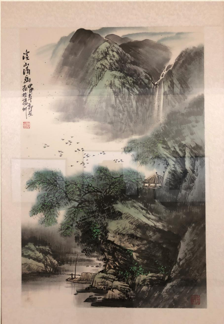
Guo Rong, Streams and Mountains – Clear Hills , 2004