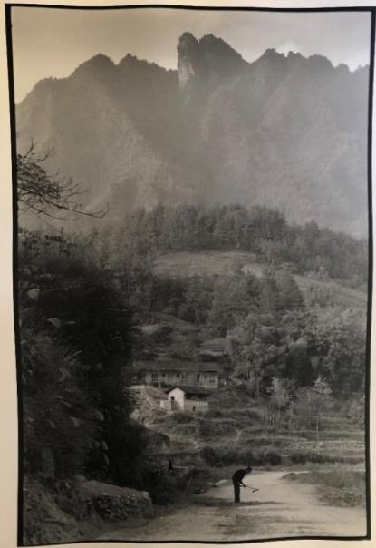
Larry Silver, Landscape, 1996